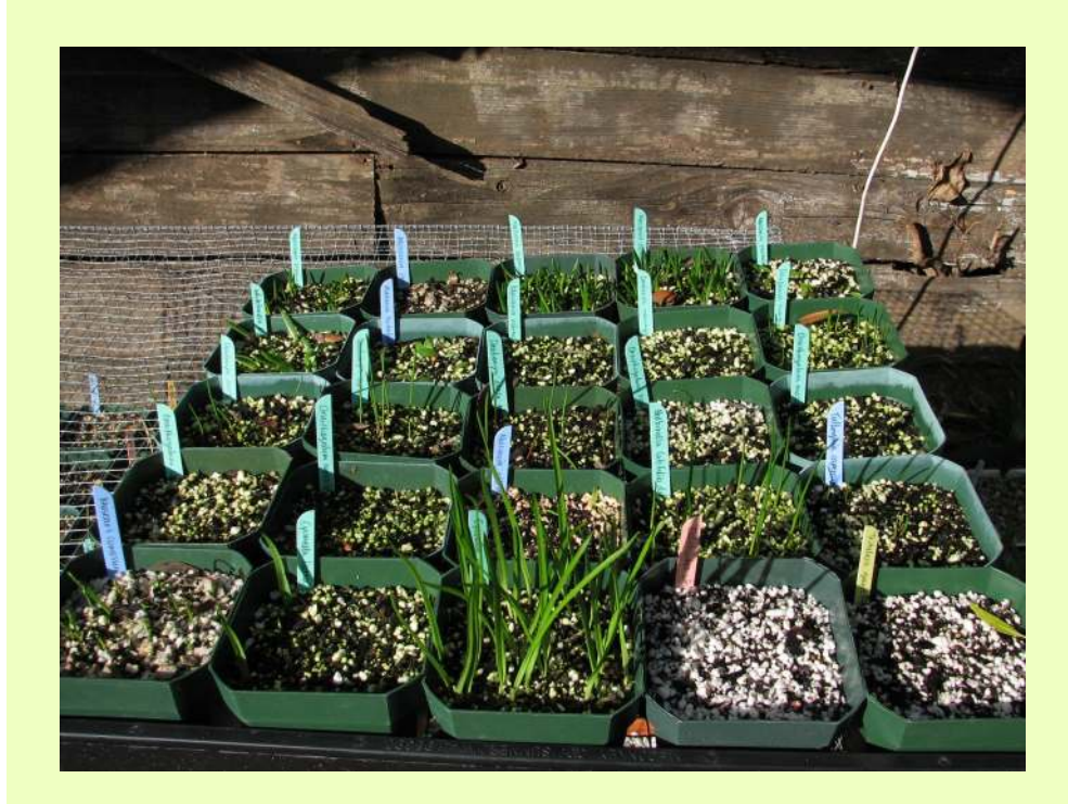
Helpful hint: Bulbs grown from seed are better kept together for their first year of life without any disturbance (like pricking).

though it is possible to grow an ample variety of bulbs under the same conditions (especially if they are adaptable plants and if grown from seed), obtaining information