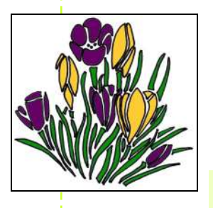
~Gardening with Bulbs ~