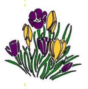
~Gardening with Bulbs ~