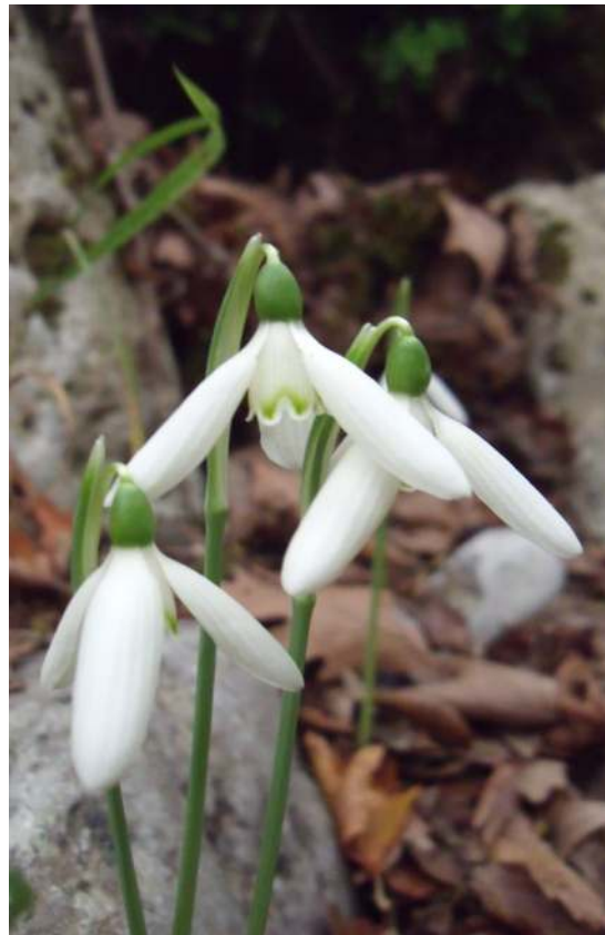
G. reginae-olgae flowers in September and October.

summer temperatures prove too high or winters too mild. The main flowering period is March to April. Look for naturalized snowdrops, snowdrop gardens, and collections. Galanthus nivalis, G. elwesii, and G reginae -