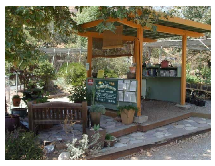
On the grounds of The Theodore Payne Foundation