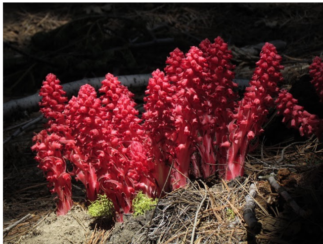
Top: Eucharis amazonica. Above: Sarcodes sanguinea.