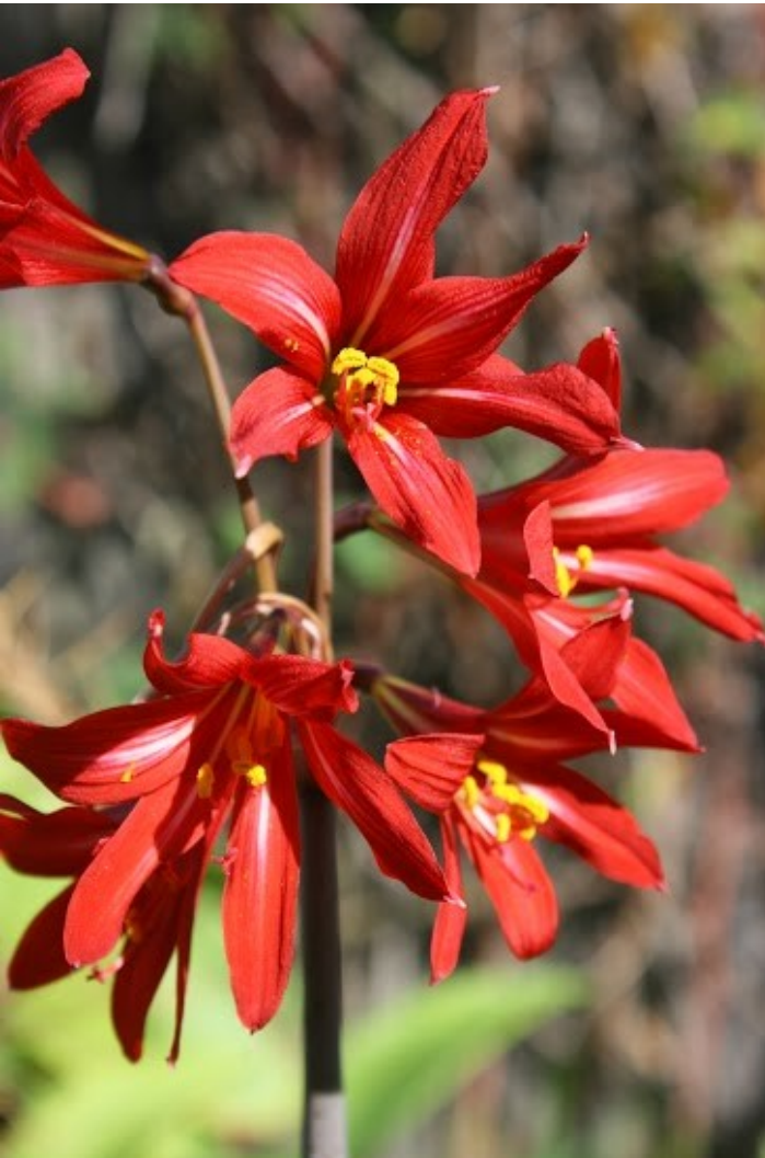
Above: Rhodophiala granatiflora . Top right: R. bifida pink form. Bottom right: R. bifida Texas form.

any further, prevention is the best treatment, so do what you can to prevent diseases from even catching in the first place. The bulb fly, Merodon equestris , one of several