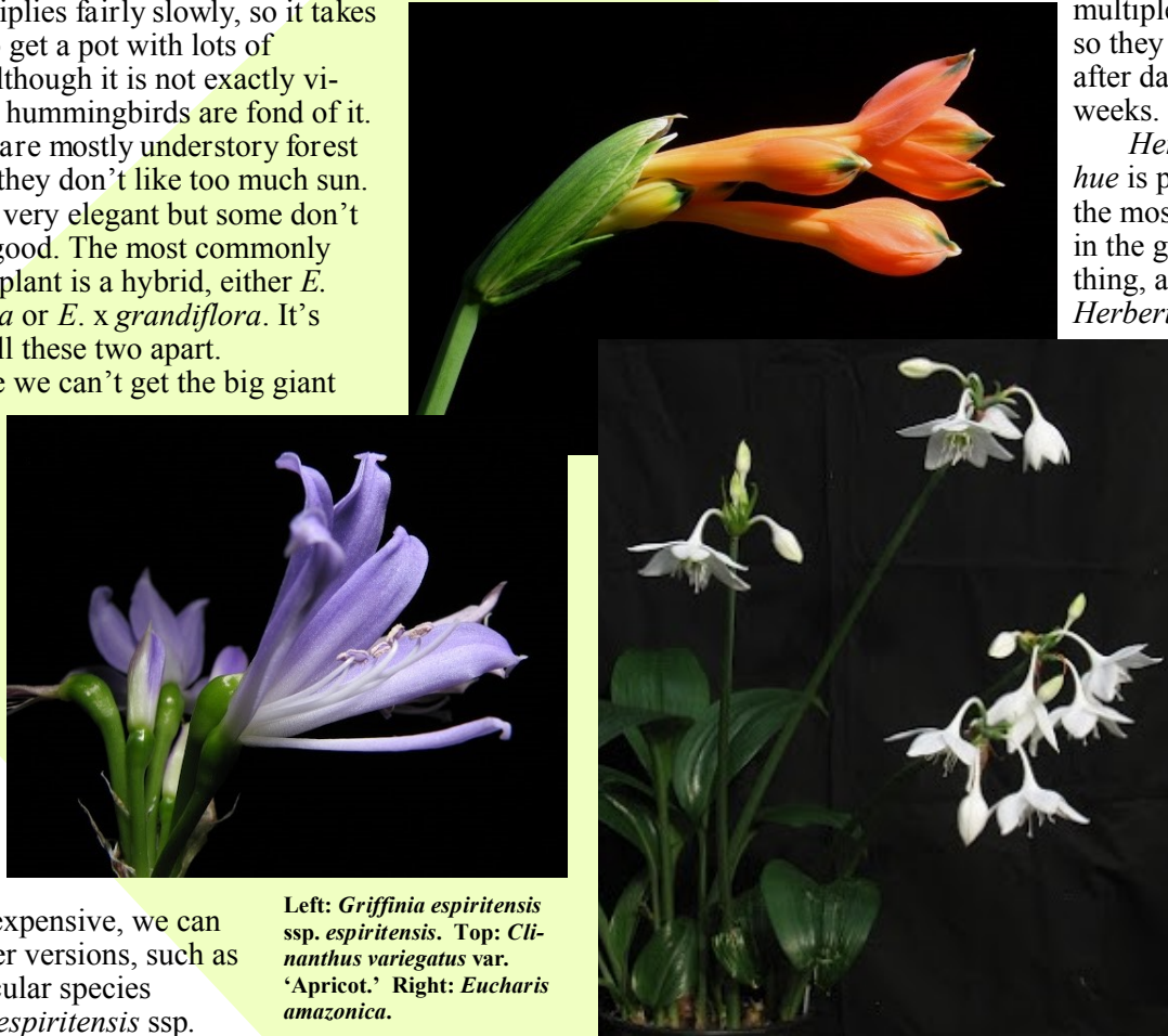
Left: Griffinia espiritensis ssp. espiritensis . Top: Clinanthus variegatus var. 'Apricot.' Right: Eucharis amazonica .