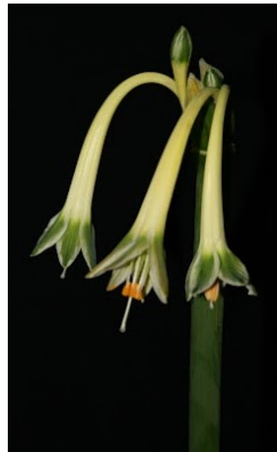
Top: Stenomesson pearci . Bottom left: Phaedranassa viridiflora . Bottom right: Clinanthus incarnatus 'Yellow.'

winters to bloom. To get them to bloom, I think the trick is to keep these slightly dryish and give them a cool enough dormancy (above freezing). Clinanthus incar- (continued to next page)