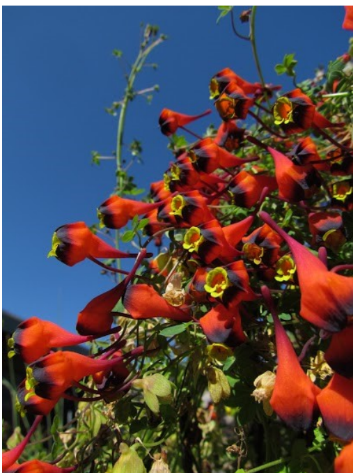
Above: Tropaeolum tricolor . Right: Oxalis perdicaria .

The reason that everyone should grow this species is because it is very easy for us here in northern California. It doesn't need any protection, has lasted through some frosty nights, and comes back every year. It's not like these other species ( T. azureum ) that can stay dormant for many years. Mine is in a one-gallon pot. You can try it in the ground but I think the rodents will find it tasty, so