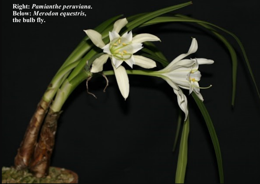
Right: Pamianthe peruviana . Below: Merodon equestris , the bulb fly.