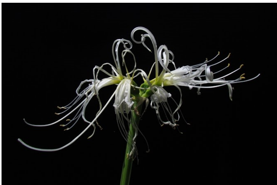
Top: Hippeastrum aulicum var. robustum . Bottom: Ismene longipetala .

The next genus is Ismene which I like a lot because it has beautiful fragrance. It used to be called Hymenocallis and there are about ten species. They look somewhat like spider lilies and are mostly summer growing and winter dormant. Hybrids are common. They enjoy well-drained soil, somewhat richer media, with moderate sun and fertilizer, but are also susceptible to a lot of pests and diseases, especially thrips. When Ismene bloom, the thrips like to come and tear up the