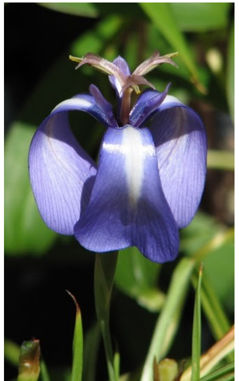
Top two photos: Cypella herbertii . Bottom two photos: Herbertia pulchella .