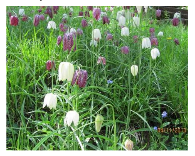
Fritilliaria meleagris are excellent bulbs for a bioswale or for a bulb lawn! Read more inside.