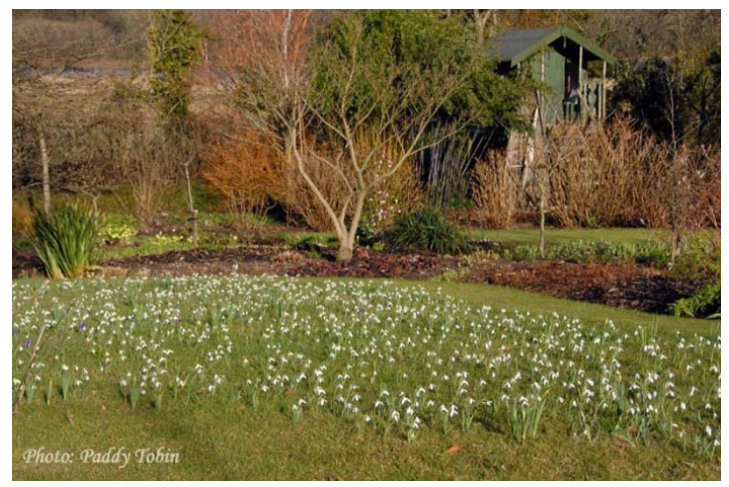
He estimates that he and his wife planted several thousand snowdrops.