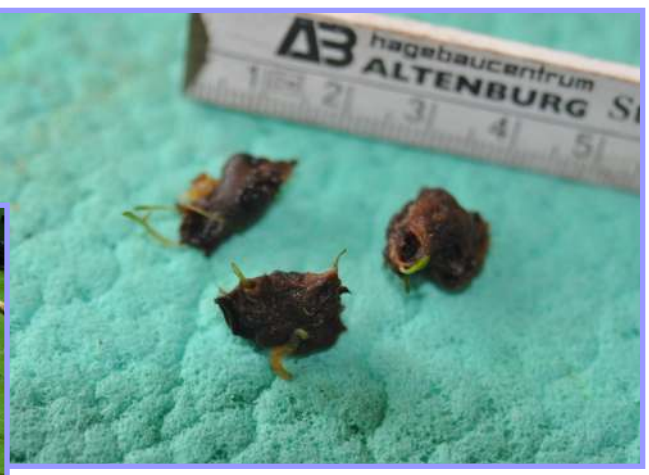
Left: Nymphaea possibly 'Tina'; Above: Leaf tubers; Below: Winter storage in unheated water.

be stored under very different conditions: moist in sand, or my preference, in sphagnum. I spray the saucer and the sphagnum with a systemic fungicide. They can also be planted in a loam substrate and kept in shallow cold water during winter. The picture of the overwintering plants was difficult to take with all the light reflections from the glass of the greenhouse and the water but you can see both an adult plant with a few pale green remaining leaves and beside that, in small pots tiny leaves of the plants that slowly sprout from the leaf tubers. The results from storing these tubers in barely moist sand were not as good but still possible. The saucer with the leaf tubers in sphagnum can be stored with or without light, cool but frost free. Length of storage does not seem to matter very much (within limits); mine have to wait from October