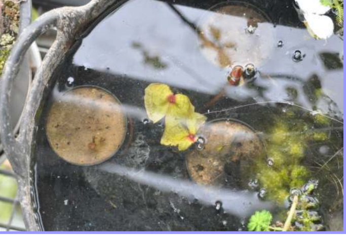
until May to be started again into growth. Those I sent to the BX last year have been stored in sphagnum in the fridge in order to keep them really dormant

Once the leaf tubers are about pea-size, some smaller, some bigger, they can be detached from the leaf. They sit on the surface of the leaf where the leaf stalk is attached below and are somewhat woolly and quite hard to the touch. These small tubers are very tough and can