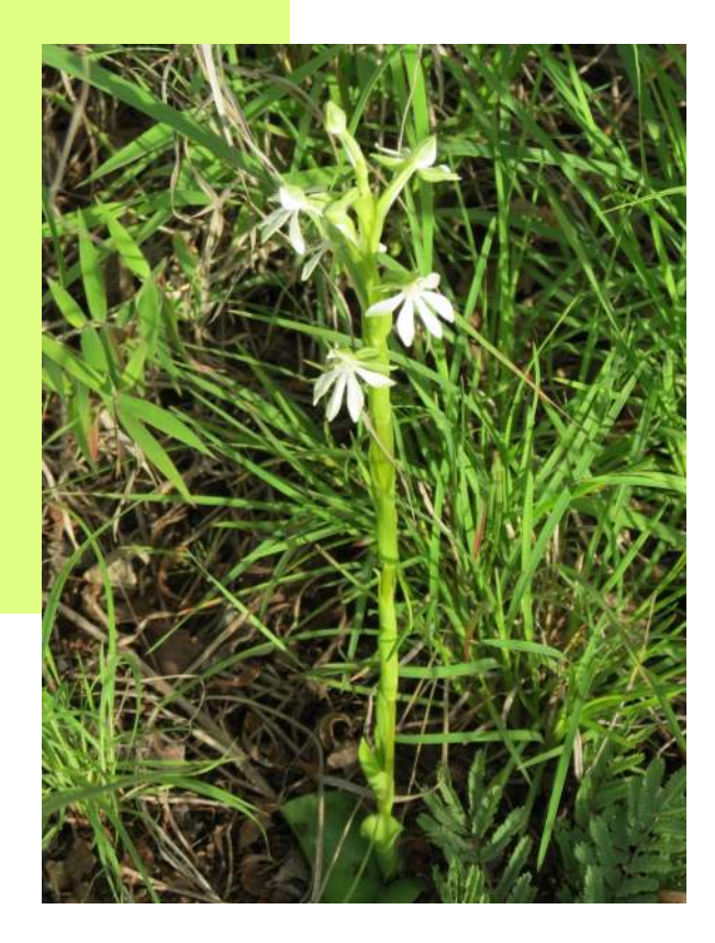
touted as a botanical paradise and it did not disappoint. Situated on a high plateau, this area offers plant fanatics