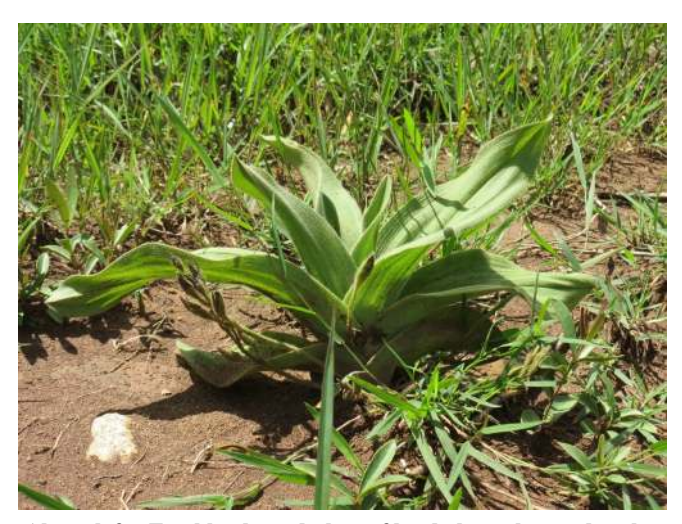
Above left: Freshly cleared plots of land along the road make for wonderful geophyte spots.

Left: Satyrium acutirostrum (Orchid family) were very abundant and easy to spot due to their brightly colored inflorescences.