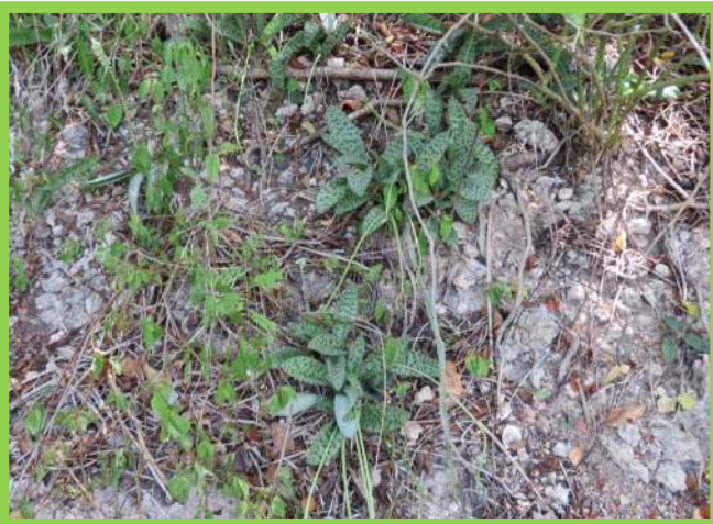
Above: Ledebouria aff kirkii; Right: Scadoxus multiflorus.

After my brief visit to Simba Farm, I traveled around the north side of Kilimanjaro and ended up at Lake Chala, which is east of the mountain at the border with Kenya. The rains for the season were a bit late so the area was very dry but thanks to the resilience of some plants, I was able to find a number of succulent and bulbous specimens while hiking during