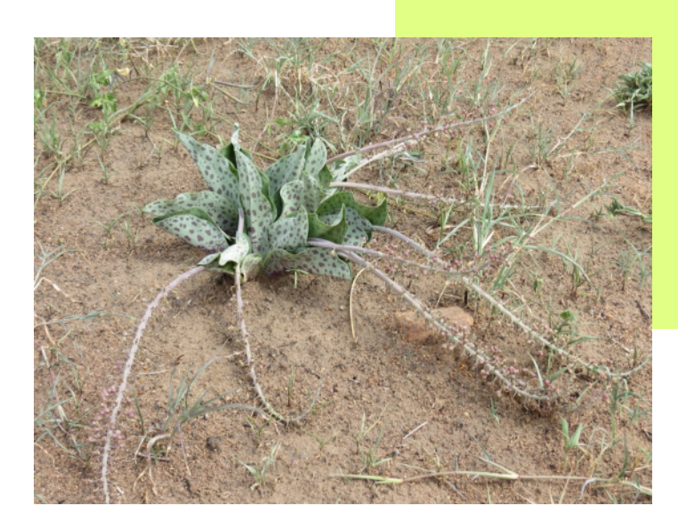
me to find them while driving 50 mph. It was at these highly disturbed sites where I found a number of gorgeous geophytes that included several Ledebouria spp., more Gloriosa superba , an interestingly furry Hypoxis (possibly H. hemerocallidea ) and Cyphostemma sp.

We then left the country of Tanzania and made our way into Zambia. After some time traversing the unseasonally wet Zambian countryside, we returned to Tanzania in order to drop off the rental vehicle. On our way north we decided to stop at Kitulo National Park, also known as Bustani ya Mungu (God's Garden), which is