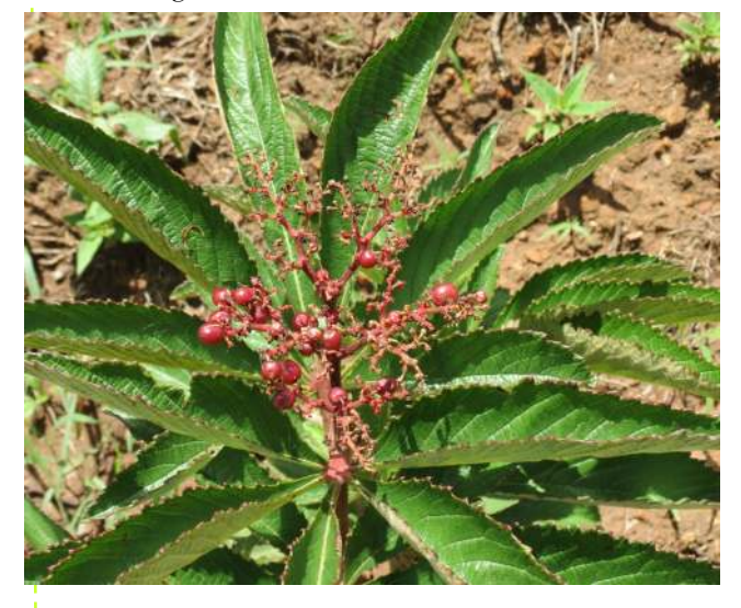
Cyphostemma sp. in Tanzania which came up when land was cleared.