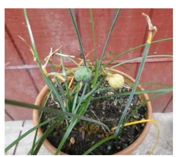
Acis nicaeensis seed. Pod on left is still green. Pod on right is almost ready

But how do you tell if seeds are ripe? Let me give you some examples. I've been watching a Calochortus for about two weeks now. These seeds are in