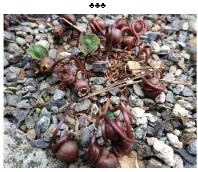
Cyclamen seed. Note the seed pod in the center is opening.

Some seed is only viable if cleaned and stored immediately in moist or damp medium such as vermiculite, if you will not be sowing as soon as the seed is cleaned. In this case, you will want to use plastic wrap folded over several times and placed in plastic ziplock bags or the tiny ziplock bagts jewelry comes in. Some examples of this would be Trillium , Disporum , Lysichiton , Hepatica and so on. Often information of which seed to treat in this manner is available in the Pacific Bulb Society archives or elsewhere on the internet. When in doubt, send a request to the PBS List. Someone on the list will know the answer.