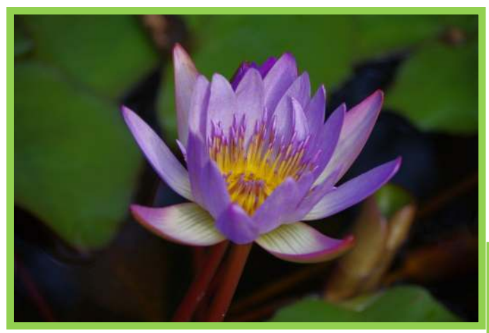
Above: Tropical blue waterlily; Right: A pond friend enjoying a summer vacation.

Starting the tubers is fun. I pot them into small pots using the same heavy loam/clay as for the adult plants and put them into a big bucket or small aquarium which is heated to 20-25° C (70-77° F) using an ordinary electric aquarium heater. Unfortunately I never took a picture of this waterlily nursery. They are only submerged a few centimeters, maybe two inches deep and given the most light possible or extra artificial light. They explode into growth within hours and form leaves and roots. Before they are transferred into their summer pool they will be potted on once or twice; pots that are too large become too difficult to handle and are not neces-