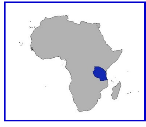
Tanzania in blue (continued on next page)

in eastern Africa, and lies at an interesting intersection between northern and southern Africa. This area is most notable for the Great Rift Valley and as being the birthplace of humankind (This is still debated though.). The region also boasts a high degree of biodiversity and is considered a hotspot of such. This is due in part to the varied topography of the region, as well as the climatic oscillations that have occurred here in the past (i.e. it used to be more tropical than today). The repeated tropicalization of the region followed by subsequent drying is one reason why you can find both arid and tropic loving plants in the area today, including a number of interesting geophytes. During my time in Tanzania, I was lucky enough to come across a number of these fascinating geophytic taxa and I made sure to thoroughly document them for your enjoyment. So let us begin.