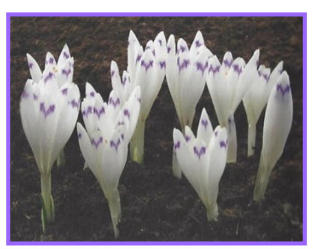
A Janus Ruksans introduction - Crocus huffelianus 'Carpathian Wonder'