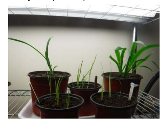
Iris seeds planted in "clock face" pattern

Fresh seed is collected in the late summer and sent in to the seed exchanges, societies, and commercial seed houses. Start with new three-inch plastic pots, as these can be had for pennies, I do not wash or sterilize old pots, because it's just not worth it with expensive or rare seeds. I have used both a purchased soilless seed starter and coco coir; the latter is excellent, but it has no nutrients. Seeds are planted in the dampened mix in a "clock face" pattern of five or six seeds per pot thus: 12, 2, 5, 7, 9, and one in the middle. This gives plenty of room for the seedlings to grow and transplant without tangled roots. You see the pattern in the photo of my seed pots. Depth of seed varies