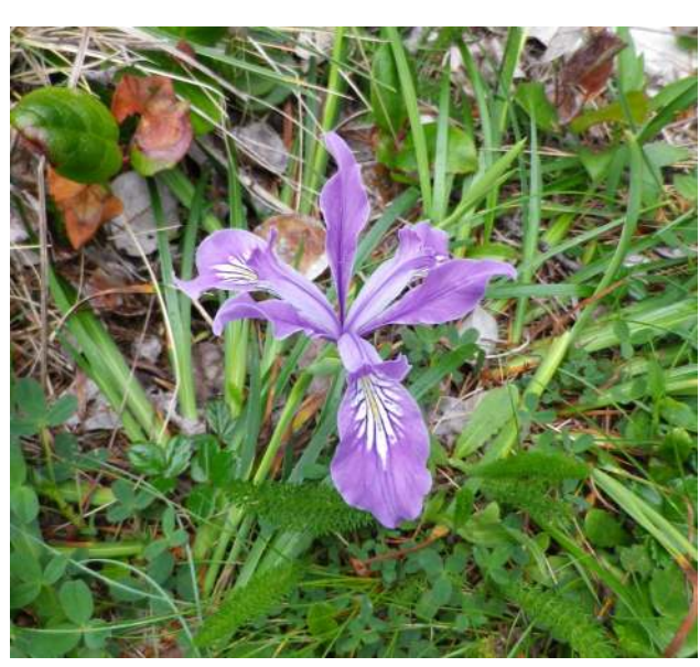
One of the native Pacific Coast Iris, Iris douglasiana