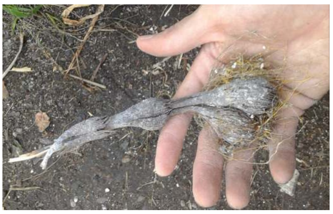
Top: Calochortus raichei; Above: Calochortus sp. bulb extension.

lanterns, like the flowers, are elegantly held upside down (with the flowers facing down); therefore it can be quite frustrating to collect seeds because they drop right out of the pods as soon as they mature. Pods should be collected just as they ripen or they should be bagged so that the dried seeds fall into collection bags. This makes it a special challenge to collect seeds in the wild.