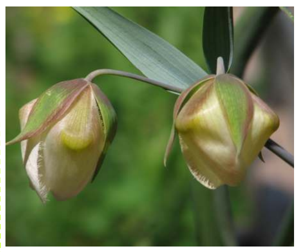
Calochortus albus.