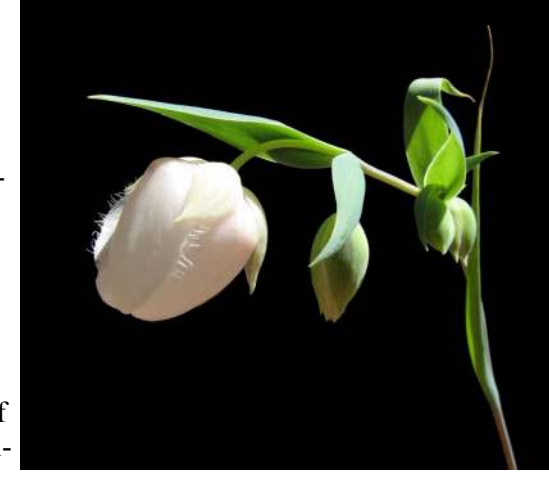
Above: Calochortus albus; Top right: C. amoenus; Lower right: C. pulchellus; Below: C. amabilis.

this group, but each of them is distinct and beautiful in