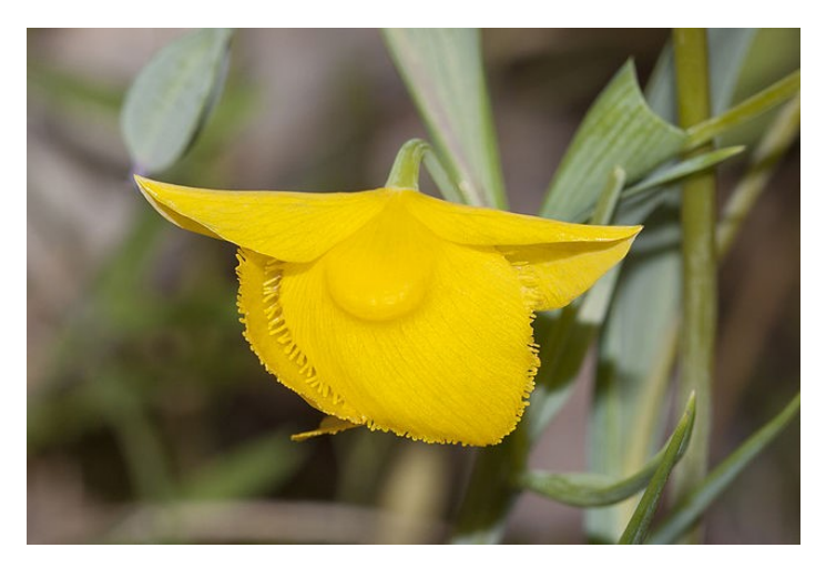
grow calochortus but have hesitated to try them, here are a couple strategies with which to start.