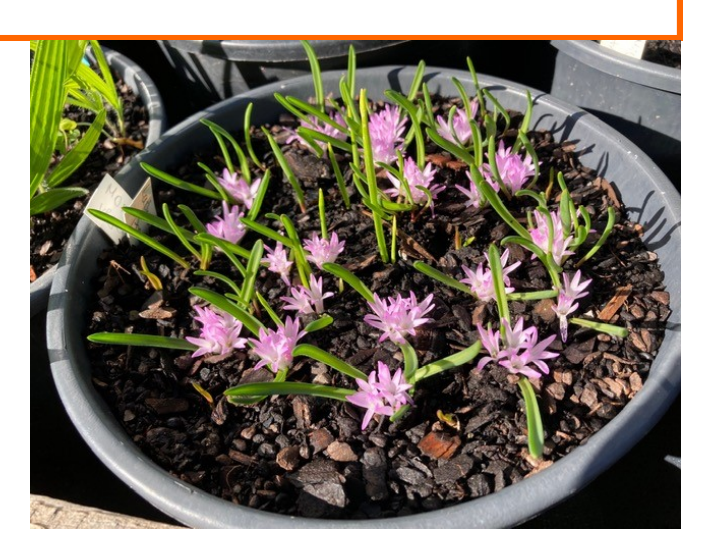
Upper left: Dahlia excelsa . Above: Lachenalia paucifolia . From an autumn 2018 sowing of Silverhill seed.

Below left: Kniphofia, possibly sarmentosa.