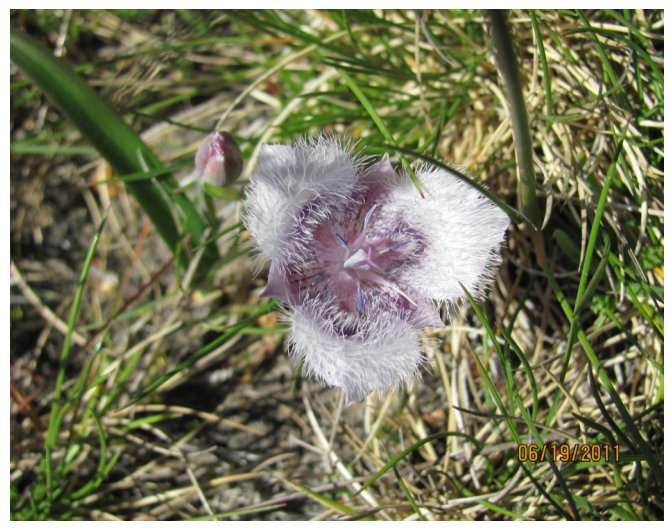
Calochortus tolmiei taken on coastal headlands, southwestern Oregon.

Fall sowing into a porous potting mix which allows for good drainage, rather than into soil in the garden, increases your chances of success. Pots can then be left in the cold frame, cool greenhouse, or other protected space. Once the seeds germinate, keep the leaves going as long as possible, because calochortus bulblets are tiny about the size of a rice grain or less. Seedlings will bloom, if you're lucky, usually in three to five years. Calochortus are summer-dormant bulbs, needing dry conditions, and should be planted two to three inches deep in the fall in sun