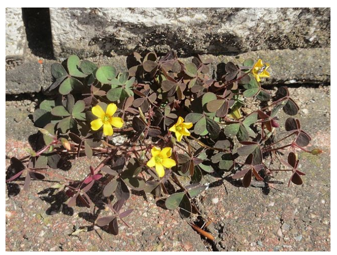
Oxalis corniculata. The Weed.

When we may be wary of trying new bulbs, the Wiki can help us pick those that are wellbehaved. + + +