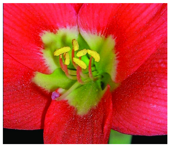
Fig. 86. Detail of the base of the petals, stamens, and pistil of Hippeastrum starkiorum .