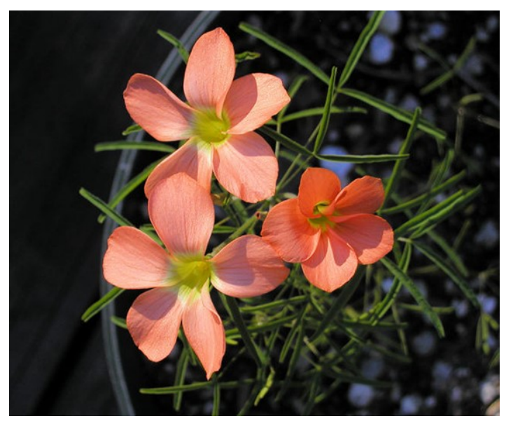
Oxalis gracilis.

-pink or white flowers with a yellow tube. Mine is truly an apricot color and doesn't fade much at all as the flowers age. It seems quite vigorous but maintains its leafy delicate appearance. It tends to flop if not given enough light.