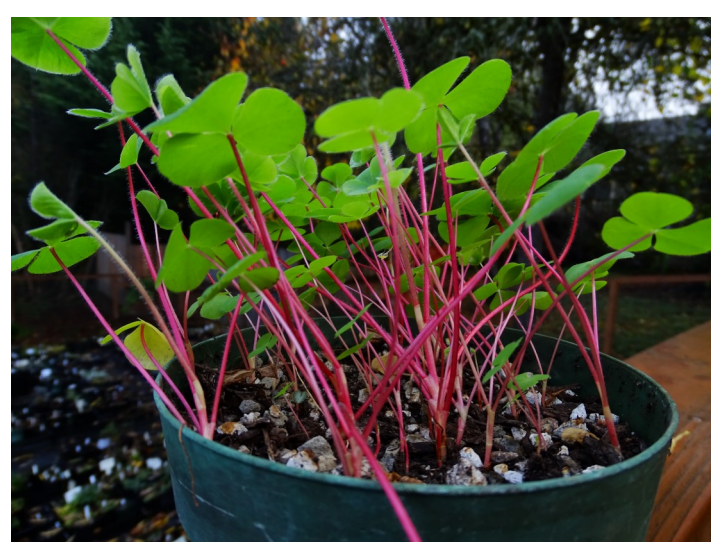
Oxalis sp. possibly O. potamophila. This bulb came from a PBS bulb exchange several years ago. The red stems contrasted with the grass green leaves are striking. The flowers are bland by comparison.

Another oxalis species I received from the bulb exchange that has leaves similar in color, size and shape to our native Oxalis oregana , but with bright red stems and pale lavender flowers, is possibly Oxa lis potamophila , which is native to Brazil. Compared to the brilliant stems, the flowers look washed out. It grows in summer with a liking for higher altitudes and good moisture, and goes dormant in winter. It's a striking species even without blooming.