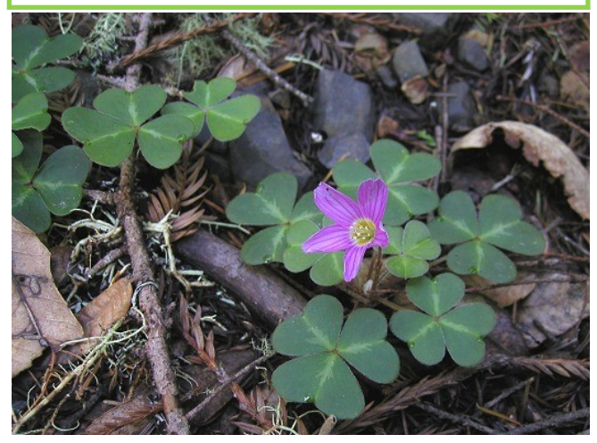
Oxalis oregana , sometimes known as wood sorel or redwood sorel. A rhizomatous western American native, a good groundcover for moist wooded areas.