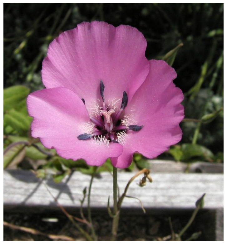
Above: Calochortus splendens . Below: Calochorus amabilis .

So, to sum up propagating calochortus from seed and growing from bulbs: if you're a regular sower of seed, start with the species that are considered the easiest or with those that grow wild in conditions similar to yours. If you've always wanted to