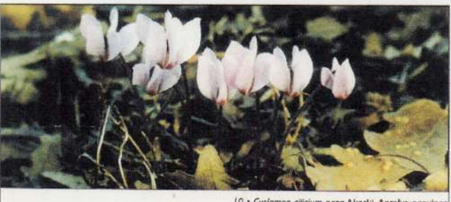
10 · Cyclamen cilicium near Akeski, Antalya provinc

For growers of Cyclamen it provides an insight (pages 8 to 24) into the growing conditions required by each species as localities are described, often with photographs of the habitat.