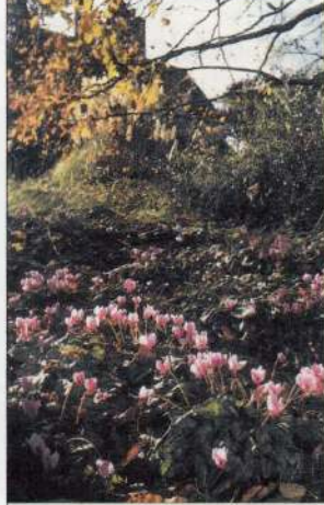
en heterfolum is one of the most successful species in the garden

In this succinct text flower shape, colour and fragrance are discussed, distribution and