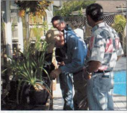
Members checking out plants donated for the bulb auction.