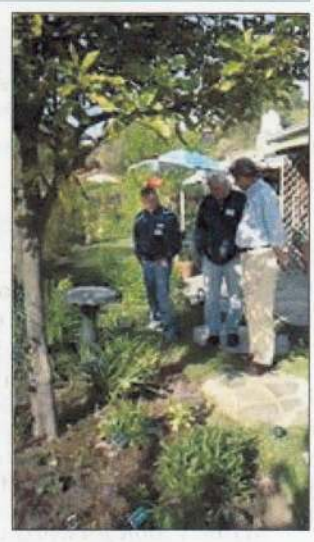
Members regarding the bed beneath my Macadamia nut tree, where S. natalensis grows (see below left)

In addition there were some diosporia. The tubers look like small potatoes. These are dormant for perhaps 7 or 8 months of the year but will put up a gorgeous vine of very large dark green leaves in summer. My tubers are planted perhaps one to three inches deep.