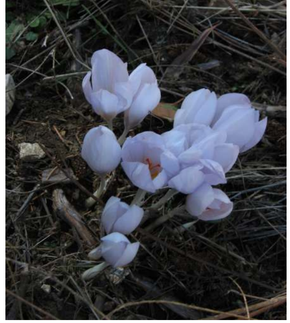
This page, clockwise from top left: Crocus niveus, C. goulimyi, C. mathewii, C. asumania, C. biflorus ssp. wattiorum, C. pallasii.