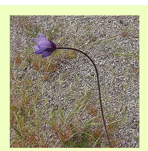
Dichelostemma capitatum (pulchellum).

before it blooms in mid to late spring. Blooming in habitat happens only with plentiful winter rains, about once every ten years. In gardens with a little irrigation it blooms every year and reseeds plentifully. Unwanted sprouts are easy to pull, and the