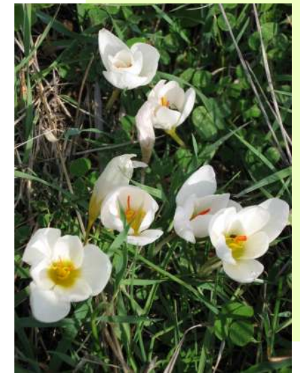
Above: Crocus hadriaticus Below: Crocus boryi

and most brilliantly where a recent brush fire had left the red soil quite bare. This plant should be in every garden in the drier parts of California, if only seed of these fine forms could be distributed.