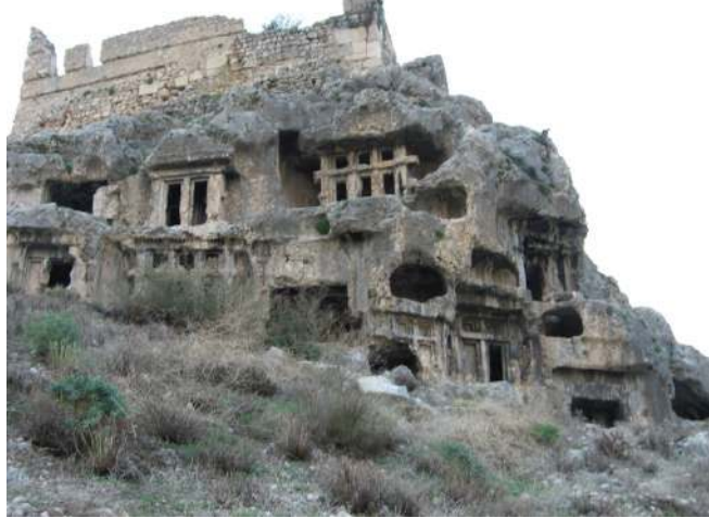
Tlos.

archaeological sites where grazig animals are ex-