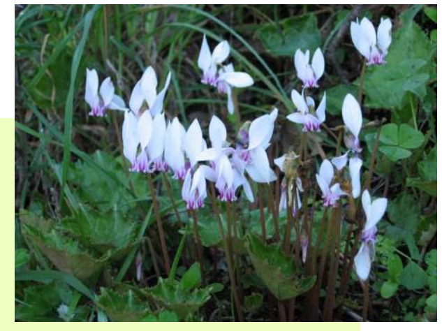
Cyclamen hederifolium var. confusum

The Turkish sites are less "improved," which gives them a more poignant atmosphere and richer vegetation. Termessos was a great place for Col chicum baytopiorum ; Galanthus peshmenii and Cy -