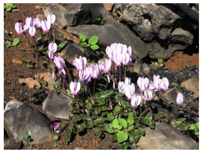
Above: Cyclamen graecum