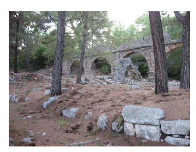
Phaselis ruins. Photo by Jane McGary