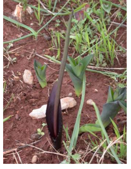
Clockwise from top left: Arisarum vulgare, Sternbergia sicula, Biarum tenuifolium, Sternbergia clusiana, and Biarum pyrami.

though this is not a universal opinion, we were fortunate to see S. clusi ana in Antalya. The last species flowers before the leaves emerge, bearing upright goblets of pure gold. (I was excited to see it in the (Continued on page 4)