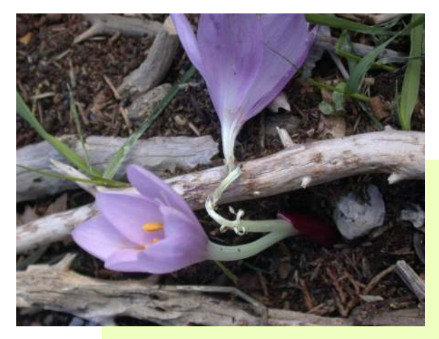
This page, clockwise from top left: Colchicum parlatoris, C. psaridis, C. variegatum, C. san guicolle, C. species - Turkey, C. boissieri, C. cupani (center).