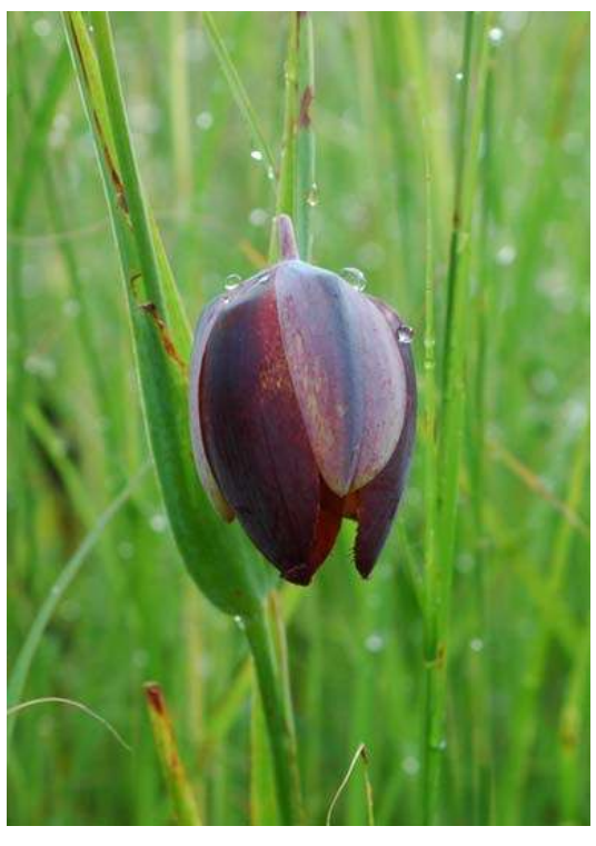
Week Calochortus hartwegii. Jalisco, Mexico.

For the last few years, we have spent a least one day, often two or three, of nearly every week