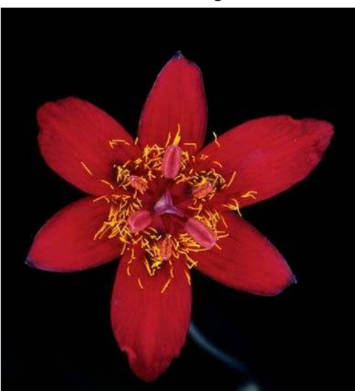
Calochortus fuscus. Estado de Mexico, Mexico.