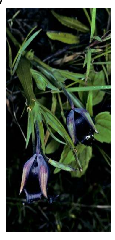
Top left: Calochortus balsensis. Guerrero, Mexico. Bottom left: Calochortus exilis. Hidalgo, Mexico. Above left: Calochortus cernuus. Morelos, Mexico. Above right: Calochortus nigrescens. Oaxaca, Mexico. Below: Calochortus mendozae. San Luis Potosí, Mexico.