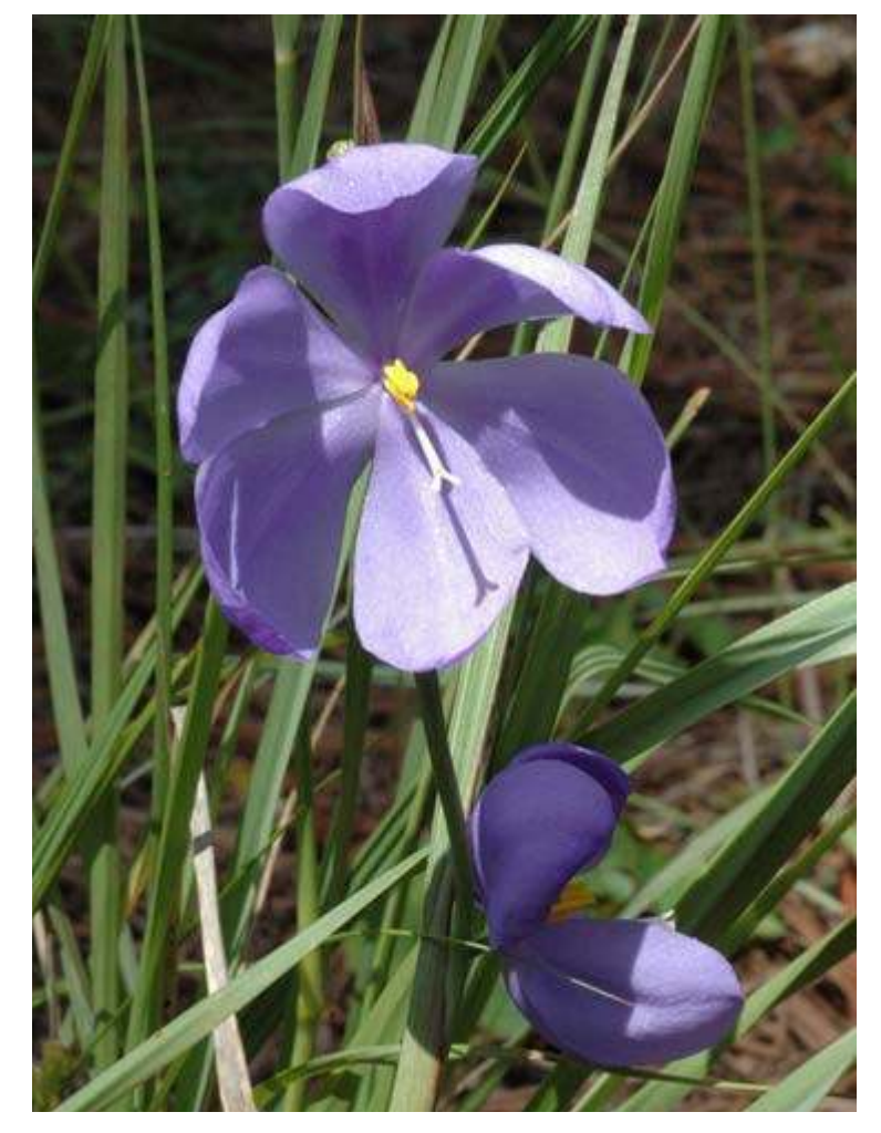
Top, L-R: Calochortus barbatus (inset showing inside view of flower). Hidalgo, Mexico. Tigridia tepoxtlana. Morelos, Mexico. Tigridia bicolor. Oaxaca, Mexico. Bottom left: Tigridia matudae. Morelos, Mexico. Above: Cardiostigma mexicana. Estado de Mexico, Mexico.