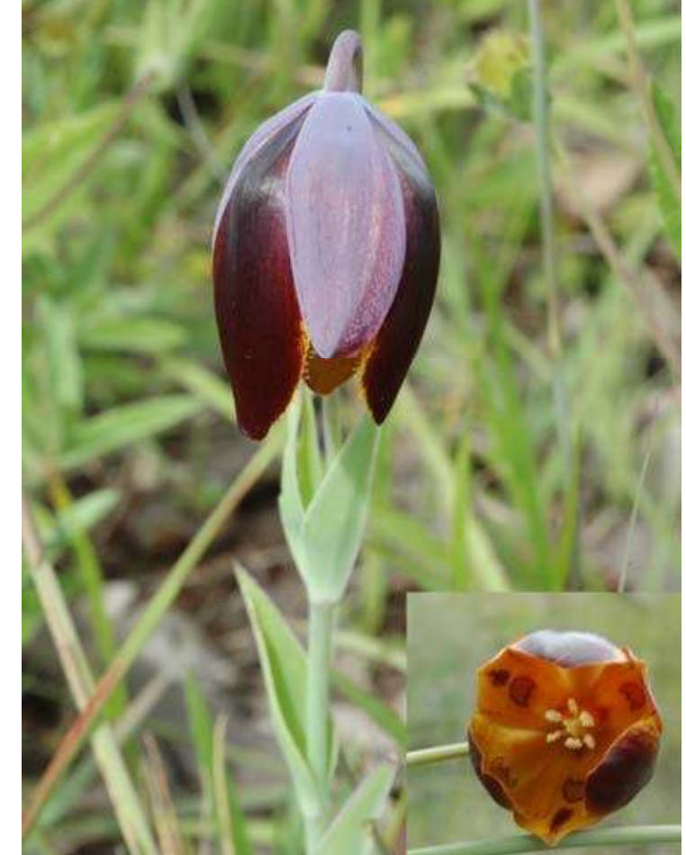
Clockwise from top left: Calochortus spatulatus. Estado de Mexico, Mexico. Calochortus ownbeyi (ined.). Jalisco, Mexico. Calochortus purpureus. Michoacán, Mexico. Calochortus venustulus. Estado de Mexico, Mexico.