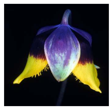
Calochortus barbatus ssp. chihuahuaensis. Durango, Mexico.