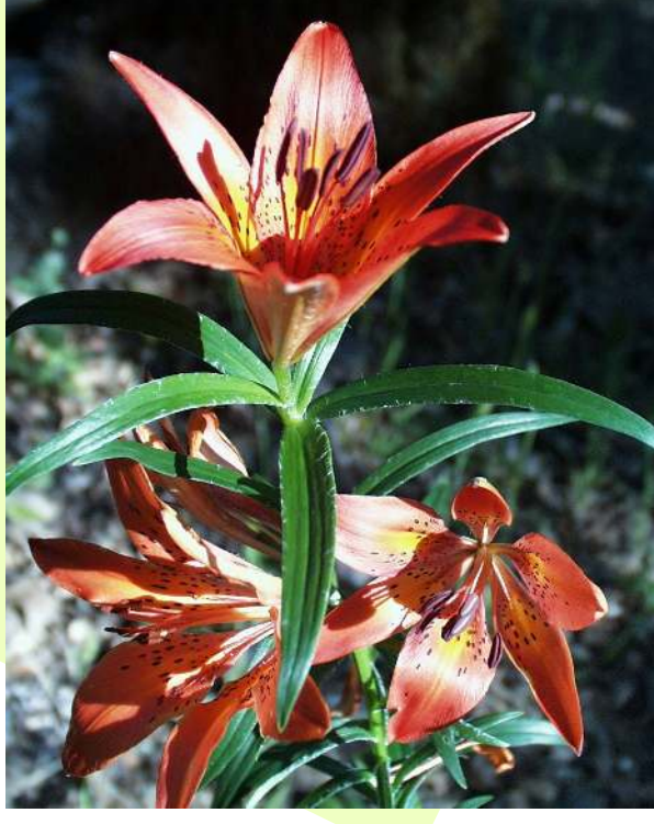
edible bulbs and medicinal uses. "The Flower which Turns its Head to See its Offspring"* produces bulbils in its leaf axils, setting it apart from the otherwise very similar L. leichtlinii var. maximowiczii . It is native to China, Japan, and Korea and displays recurved tepals of vermillion-orange

Asian lily to have reached western gardens.