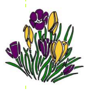
~Gardening with Bulbs ~