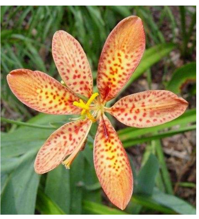
Iris domestica, also known as Belamcanda chinesis.

Thus, native species of Arum , Crinum , Erythronium , Lilium , Trillium , several rain lilies, and others do well in the North American Midwest and Southeast. In the American Southeast, some bulbs do so well (yet not so well so as to be considered weeds) that they are called pass-along plants ( Crinum , Lycoris ), passed from gardener to gardener as gifts and less commonly sold commercially. A host of genera from the Mediterranean does excellently throughout the warmer parts of Europe, where these